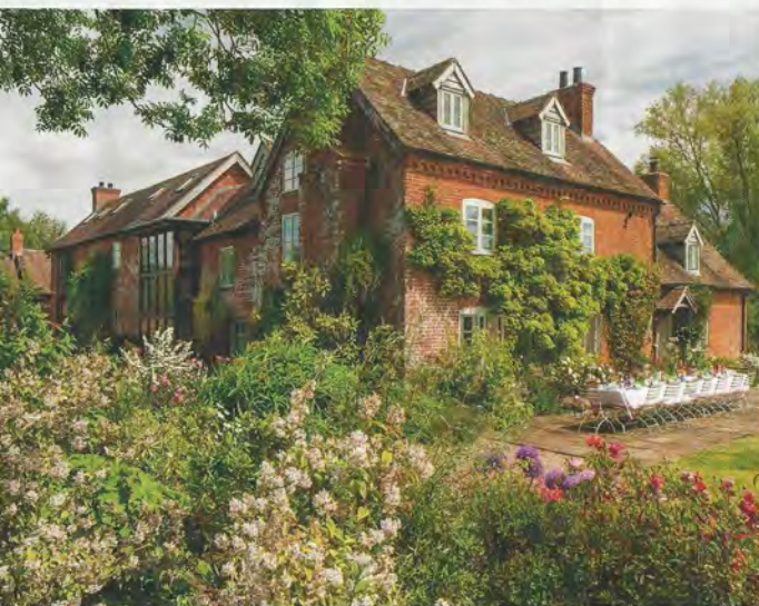
A paved terrace offers views across this garden designed by Robert Myers Associates