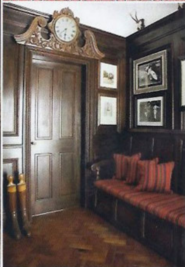
Above: We also often panel small rooms to add some more character to a rather small or plain room