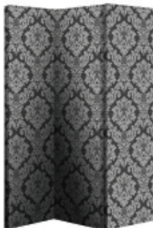
Damask screen, £75. Arthouse , 01706 230077, arthouse.com