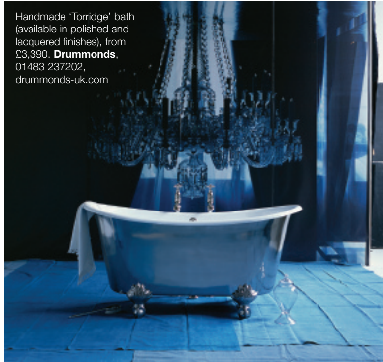
Handmade 'Torrige' bath (available in polished and lacquered finishes), from £3,390. Drummonds , 01483 237202, drummonds-uk.com

VSP Interiors (Dorchester), vspinteriors.com