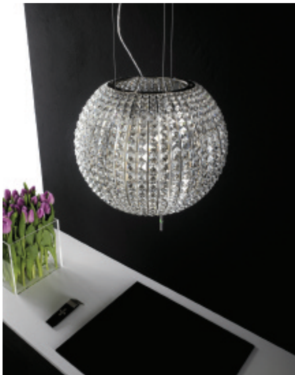
'Star' cooker hood, RRP £2,249. Elica , 01252 351111 for local stockists, elica.co.uk