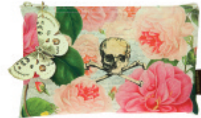
Tokyo Milk skull and roses cosmetic bag, £17.50. Berry Red , 01432 274805, berryred.co.uk

The devil is in the detail with these luxurious touches