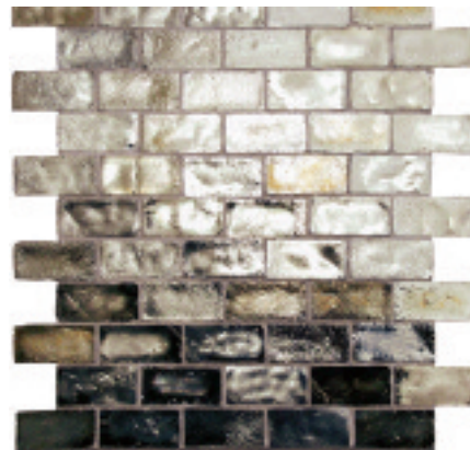
Hand-finished 'Pewter' iridescent glass mosaic tiles, £38.28 per tile. Fired Earth , 0845 293 8798, firedearth.com