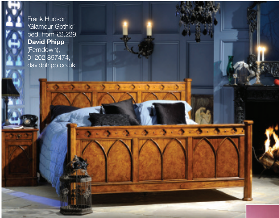
Frank Hudson 'Glamour Gothic' bed, from £2,229. David Phipp (Ferndown), 01202 897474, davidhipp.co.uk

Add some drama – and a touch of glamour – to your interior design with Gothic-style furnishings and flourishes