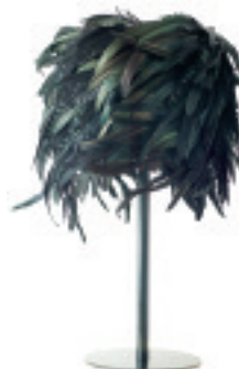
'Noir Plume' lamps: standard lamp (60cm) £595 plus VAT, floor lamp (175cm) £745 plus VAT. House Couturier , 0207 371 9255, housecouturier.eu