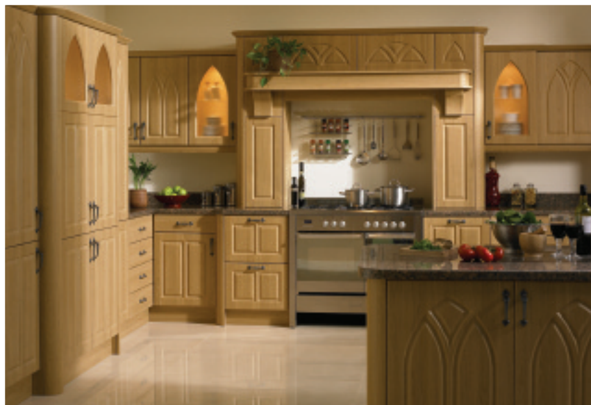
Lissa Oak Gothic replacement doors by BA Products, POA (dependent on made-to-measure fit). Dream Doors (Dorchester), 01305 268003, dreamdoorsltd.co.uk