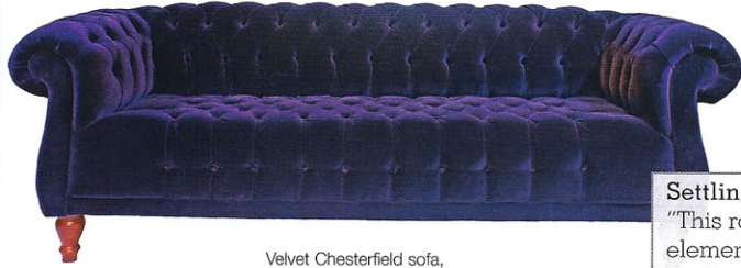
Velvet Chesterfield sofa, The Handmade Sofa Co (Wimborne), £2,200. 01258 841414, handmadesofacompany.co.uk

Glam up your lounge with striking shapes and shimmering accessories